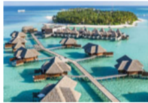
Discover Nurai Island