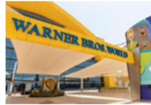
Discover Warner Bro. Abu Dhabi

Hotels | Flights | Car Rental | Deals | Cruises