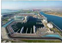
Discover Marinas in Abu Dhabi